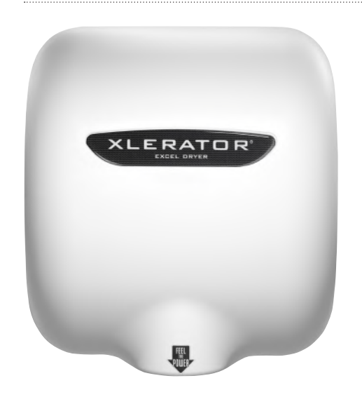
XL-BW White Thermoset Resin (BMC)