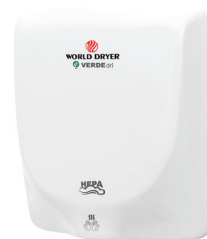
Aluminum , White