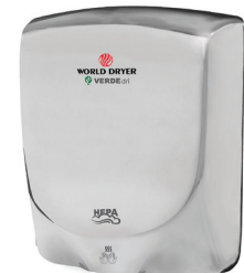
Stainless Steel , Polished