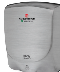
Stainless Steel , Brushed