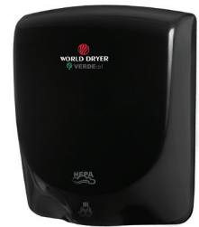
Aluminum , Black