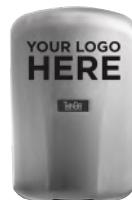
TA-SB-SI 3 Brushed Stainless Steel Special Image