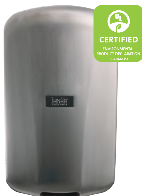
TA-SB Brushed Stainless Steel

MODELS: TA - ABS W GR SB SI SB-SI SP OPTIONS: -VOLTAGE (See Chart)