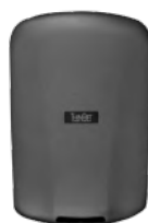
TA-GR Graphite Textured Painted