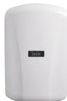
TA-ABS White Polymer (ABS)