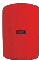
TA-SP 3 Custom Special Paint