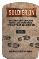
TA-SI 3 Custom Special Image