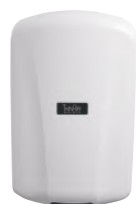
TA-W White Epoxy Painted