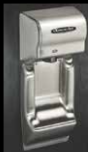
ADA-WG WALL GUARD