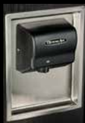
ADA-RK RECESS KIT