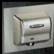
AP ADAPTER PLATE