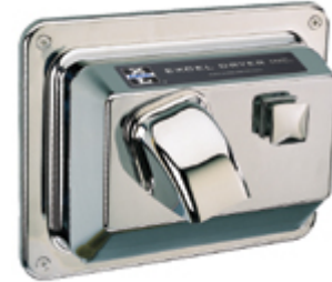
R76-C Recessed mounted Chrome Plated Cover