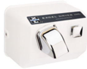
76-W Surface mounted White Epoxy Painted Cover